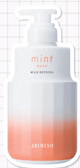
MASK MILD REFRESH