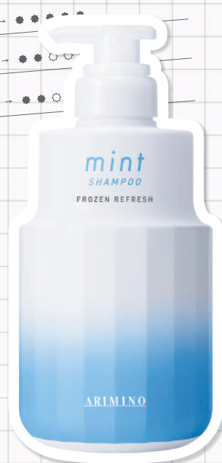
SHAMPOO FROZEN REFRESH