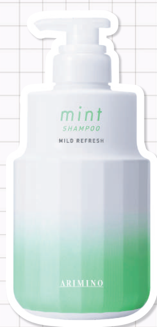
SHAMPOO MILD REFRESH