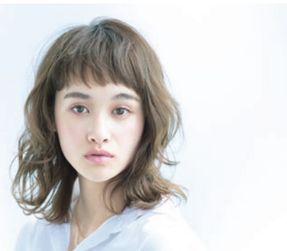
A trendy hairstyle with the hair down