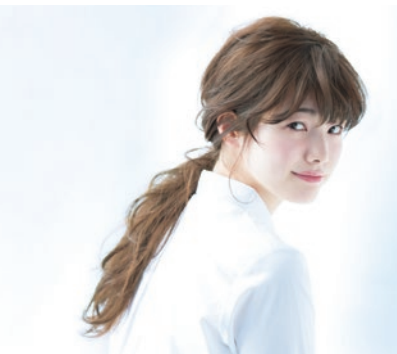
An arranged low panytail